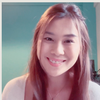
Pink Martini - Sympathique (Cover)