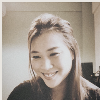
Moon River (Cover)

(Click on the thumbnail to access the media.)