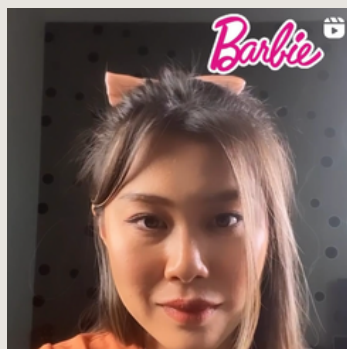
Barbie Girl (Cover)